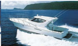
1997 - 4000 Offshore Enclosed