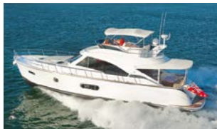
2012 - Belize 54 Daybridge