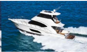
2015 - 57 Enclosed Flybridge