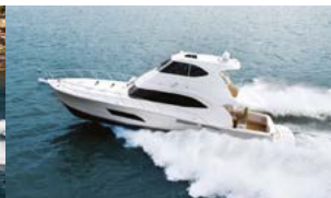
2011 - 61 Enclosed Flybridge SII