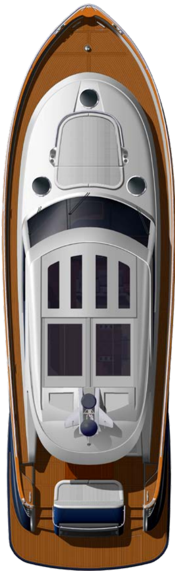
Belize 54 Sedan