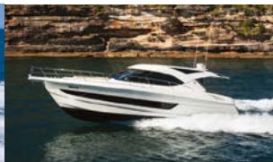
2011 - 4400 Sport Yacht SII