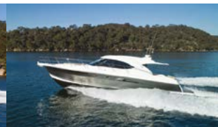
2009 - 5000 Sport Yacht