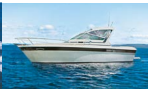
1989 - 27 Targa