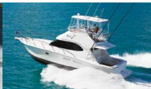
2008 - 38 Open Flybridge