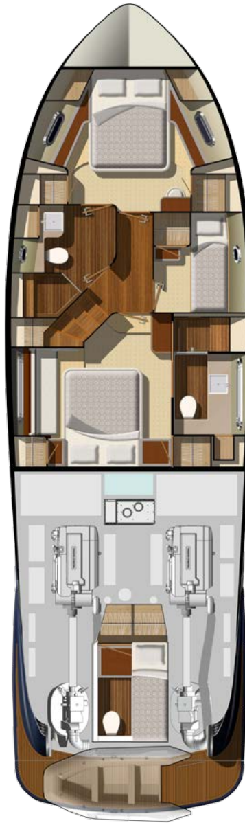
Crew cabin design option