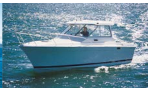
1989 - 27 Hardtop