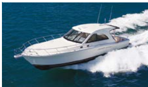
2008 - 48 Offshore Express