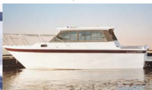
1982 - 30 Sedan