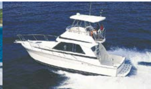
1997 - 34 Open Flybridge