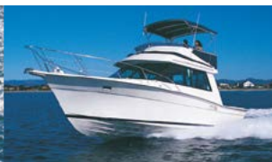
1989 - 33 Open Flybridge