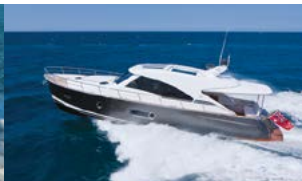
2011 - Belize 54 Sedan