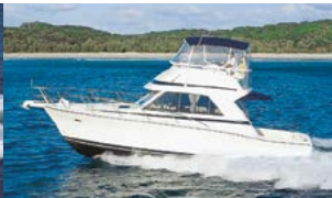
1998 - 36 Open Flybridge Single Cab