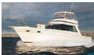
1983 - 44 Open Flybridge