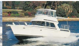
1996 - 40 Open Flybridge Aft Cab