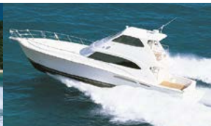
2003 - 58 Enclosed Flybridge