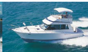
1987 - 35 Open Flybridge