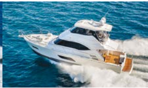
2015 - 52 Enclosed Flybridge