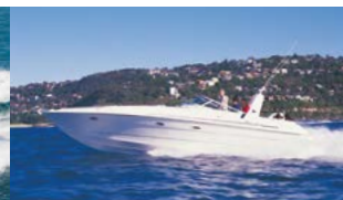
1987 - 34 Diavalo