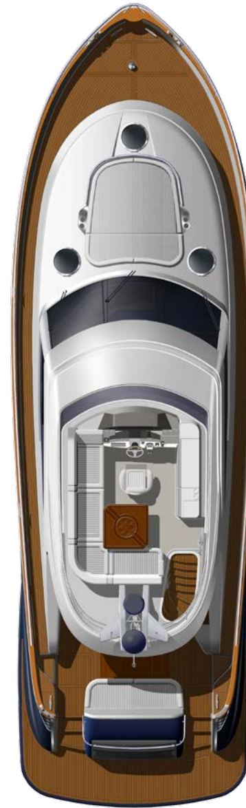
Belize 54 Daybridge