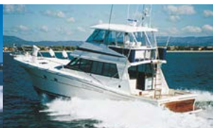
1988 - 52 Enclosed Flybridge