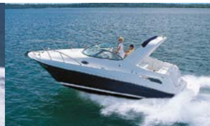
2002 - M290 Sport Cruiser