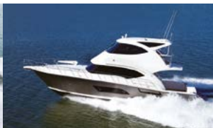
2011 - 53 Enclosed Flybridge