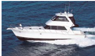
1998 - 48 Enclosed Flybridge SII