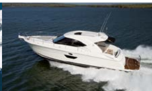
2008 - 4400 Sport Yacht