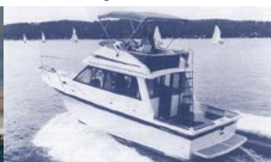
1982 - 30 Open Flybridge