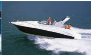
2002 - M370 Sport Cruiser