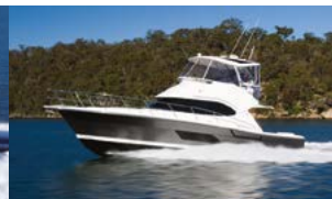
2010 - 43 Open Flybridge