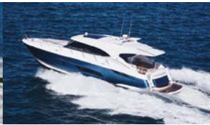
2016 - 5400 Sport Yacht