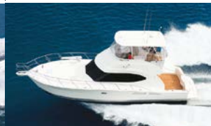
2007 - 45 Open Flybridge