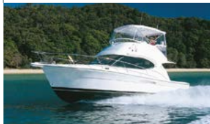
2004 - 33 Open Flybridge