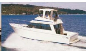
1980 - 38 Open Flybridge MK I