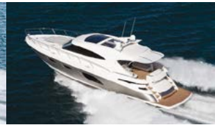
2014 - 6000 Sport Yacht