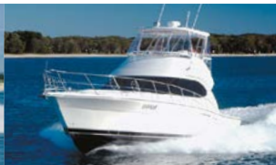
2003 - 42 Open Flybridge