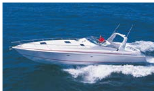
1989 - 44 Diavalo