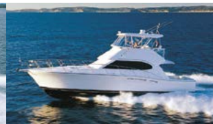
2002 - 47 Open Flybridge SI