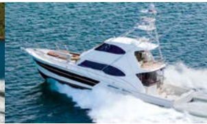
2015 - 77 Enclosed Flybridge