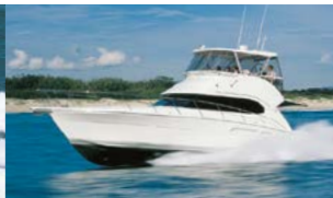
2003 - 47 Open Flybridge SII