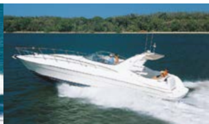
2007 - M470 Sport Cruiser