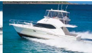
2007 - 41 Open Flybridge