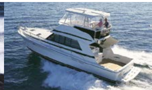
1996 - 43 Open Flybridge