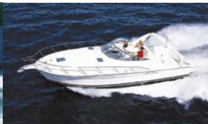
1997 - 4000 Offshore Open