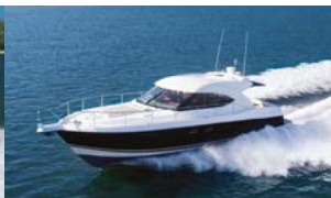
2007 - 4700 Sport Yacht